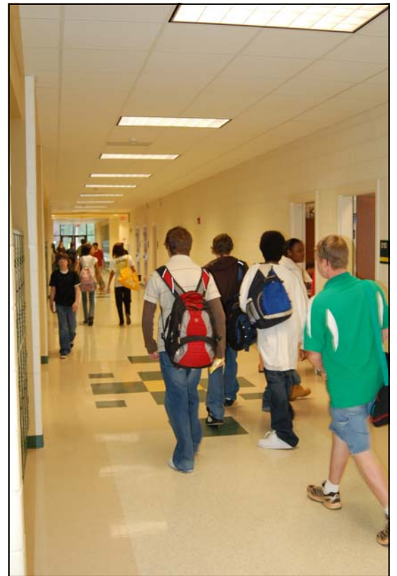
Hallway of the new classroom building