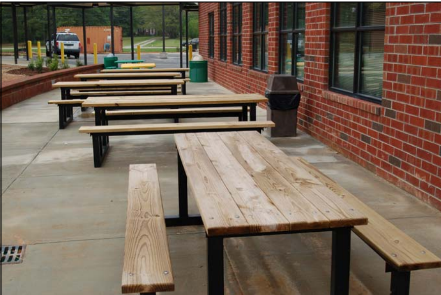
Outside eating area—with tables built by the Bunn vocational department