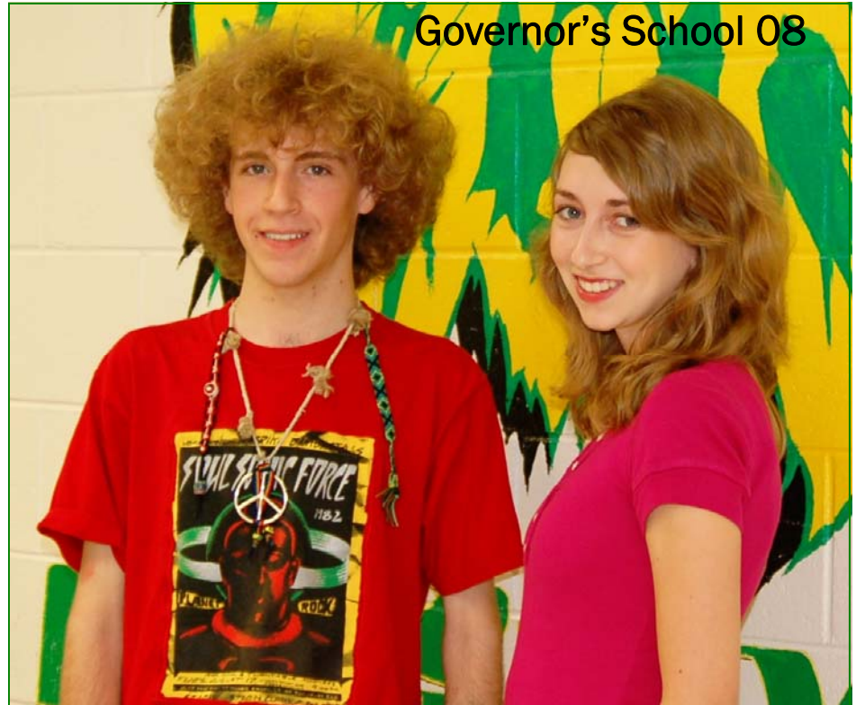
Governor's School 08

The annual student writing issue will be released in June.