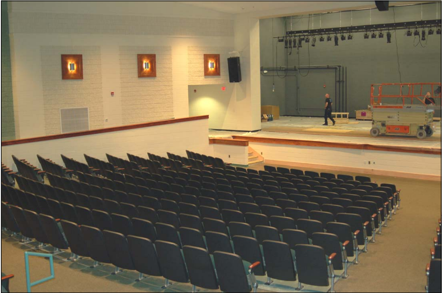
The Bunn High School auditorium was funded through the 2004 bond and is nearly complete.