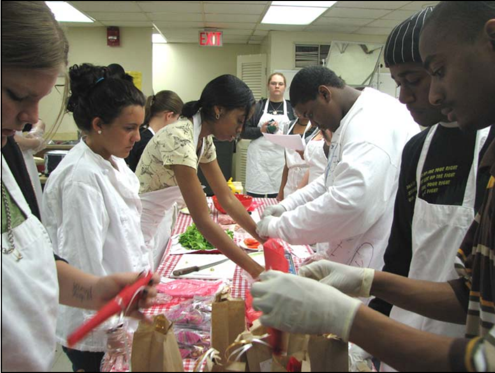
Franklinton High School students prepare food for their hungry customers.