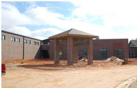
Long Mill Elementary