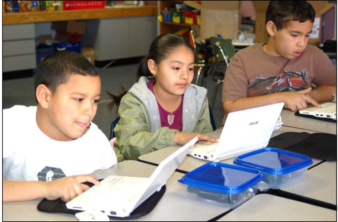
Not only are students learning new material, they are also developing computer skills.