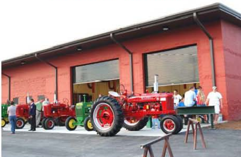
Bunn High School CTE Building