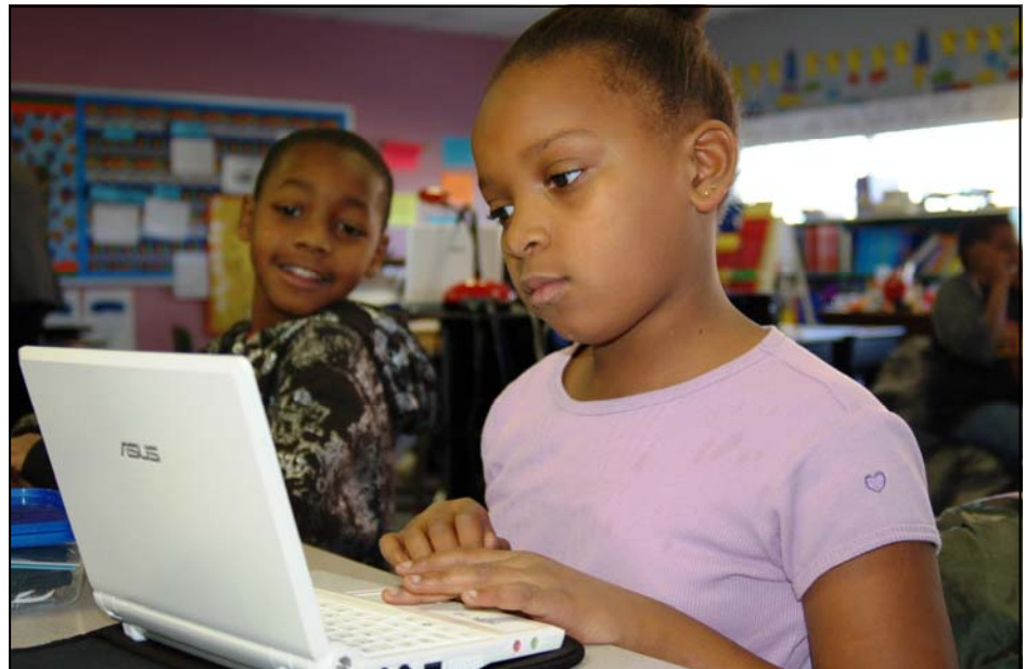
Laurel Mill students are genuinely excited with their laptop computers.