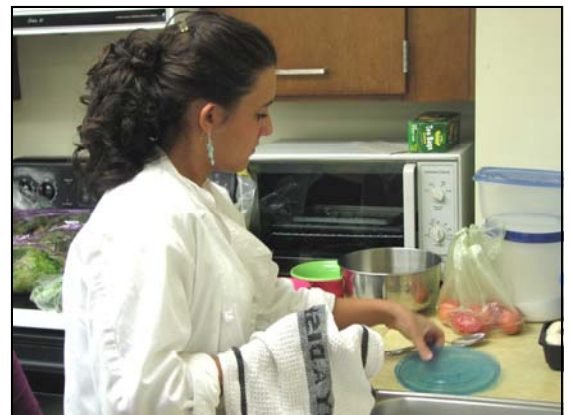
And the cleanup process begins.