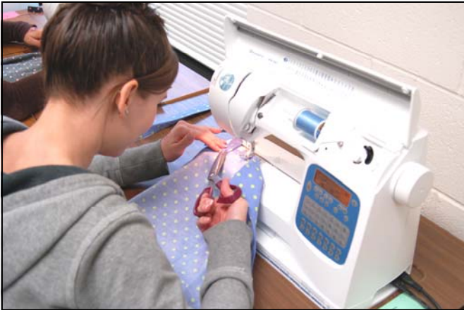
In addition to new programs, BHS also offers traditional CTE programs.