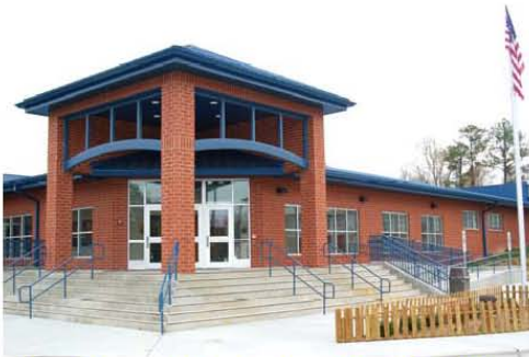
Louisburg High School Main Building