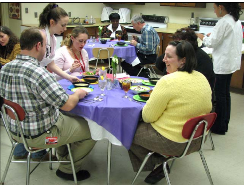
Customers enjoy the food as well as a few laughs.