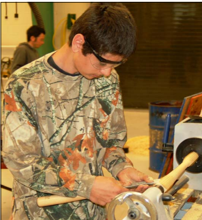
Carpentry remains a popular program among students.