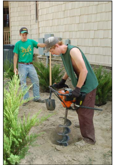
Landscaping and horticulture related activities are popular among CTE students—such as these Bunn High School students.