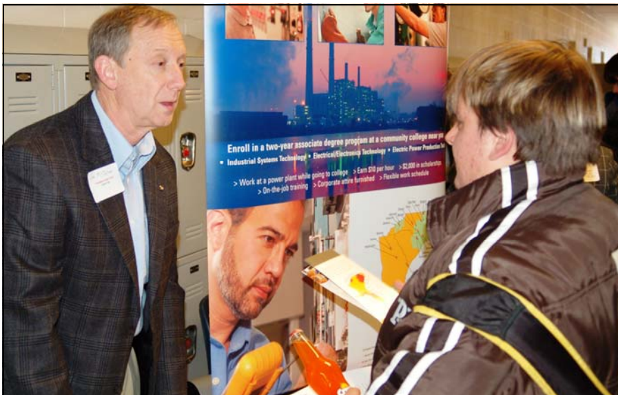
Career fairs offer students a chance to ask questions to company representatives.