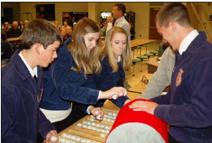
Bunn High Future Farmers of America members carefully fill the drum prior to the start of the reverse raffle.