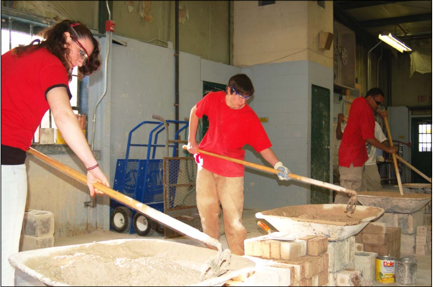
Masonry, offered at Franklinton High School, continues to be a popular choice among many students.