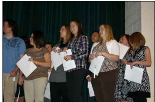
2010 NTHS Inductees