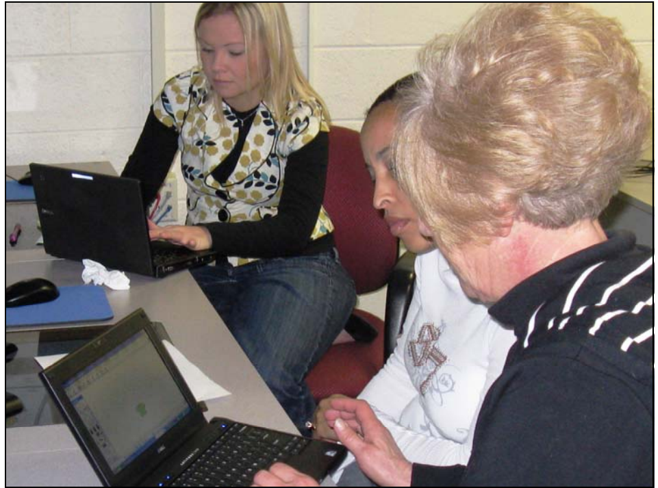
Middle school teachers are enjoying the access to the new netbooks. It's a resource that not only helps the students but also the teachers.