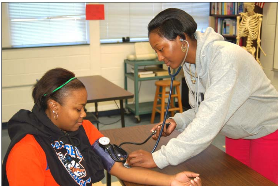
LHS students check for vital signs in Allied Health Sciences class.