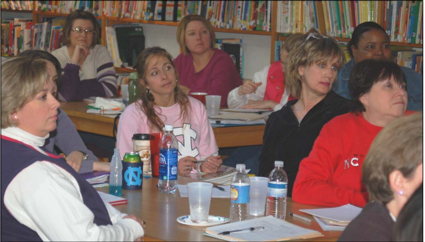
Edward Best teachers and staff recently went through a series of classes, including one outlining data driven analysis.