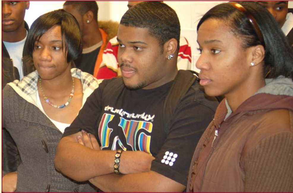
FHS Students crowd around to find out more about potential career opportunities.

F ranklinton High School has enjoyed continued success with its annual Spring Showcase, and now a similar event has taken shape.