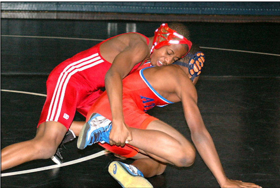
Franklinton High School secured it's first conference championships this season.