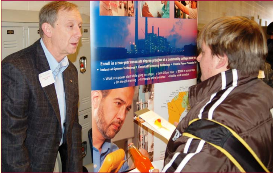
The Progress Energy booth drew its fair share of attention.