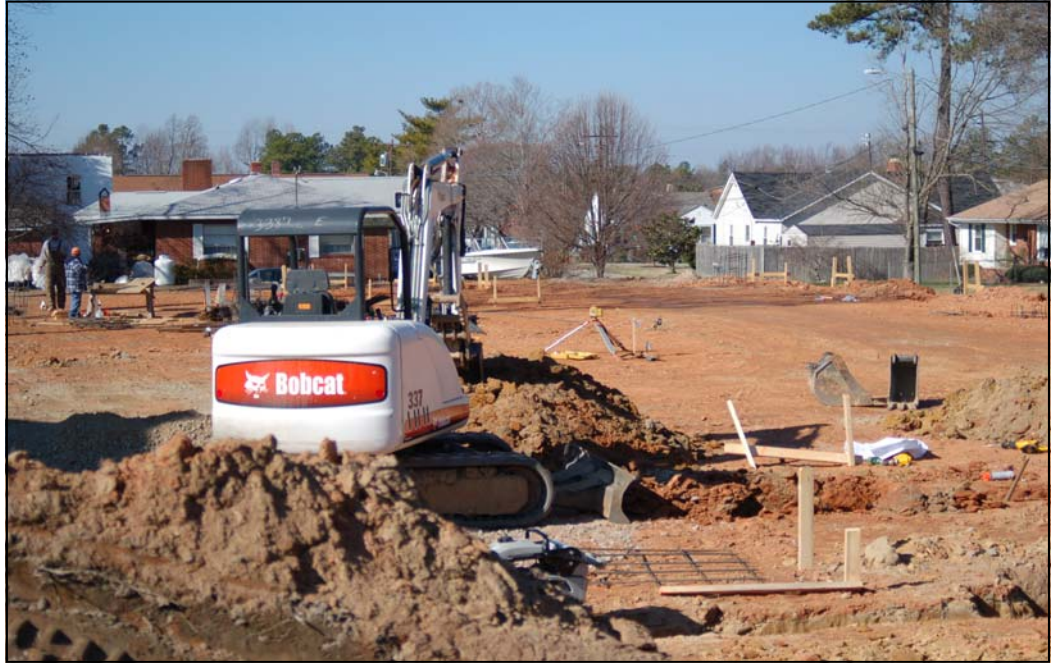
Construction has started on the 10 classroom building at Franklinton High School.

With the opening of Long Mill, also comes a redistricting process. The Franklin County Board of Education, FCS Leadership Team, and ORED are working closely to provide the best redistricting plan possible. ORED is a redistricting specialty firm that has extensive experience. It is important to keep in mind that this process must fall within the guidelines of a 40-year federal court order that requires FCS to have a racial balance